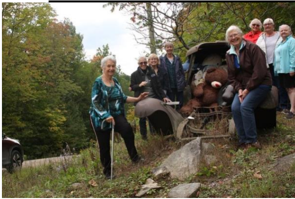
Group of Eleven Art Show and Sale